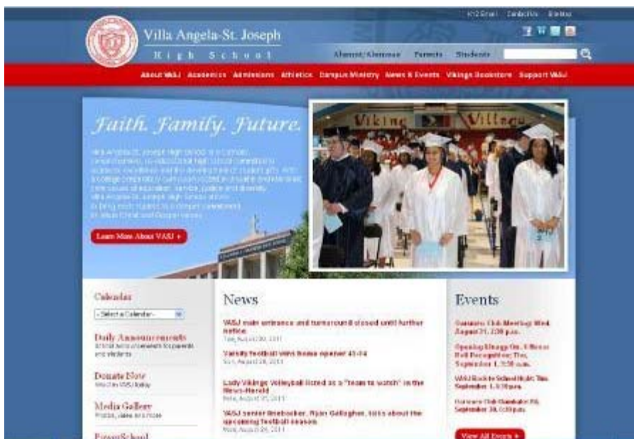
The new and improved VASJ website.

Villa Angela-St. Joseph High School is excited to announce the launch of our new website, www.vasj.com . In addition to a more updated look, the website is much more user-friendly for our parents, students, alums and friends.