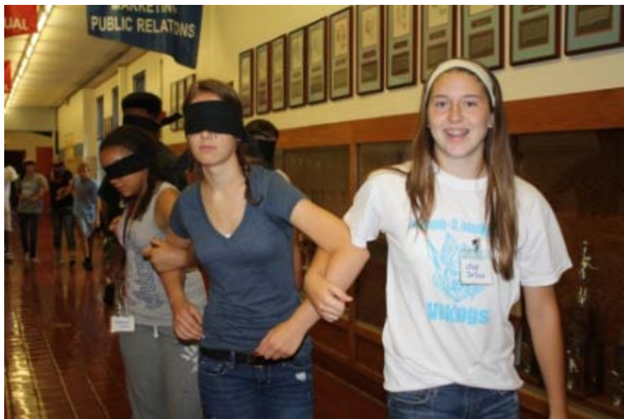
Incoming freshmen participate in a trust building exercise during Freshman Orientation at the beginning of August.

School officially began at VASJ on Monday, August 22, and we were excited to welcome our 90 incoming freshman to the Viking Village as the Class of 2015. In the beginning of August, VASJ held a Freshman Orientation giving the new Vikings a chance to come to our campus, familiarize themselves with the building, find their lockers and meet some of the faculty and staff. The freshman class was split into three groups and each group met at the school for three days.