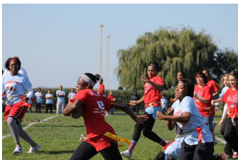
Powder Puff Football

At the end of the week, the junior and senior girls battled it out in the powder puff football game. As expected, the junior girls were no match for the senior girls. The boys in each class arranged practices to prepare for the game, which was held right after school on the field. After numerous touchdowns and great effort, the refs finally called the game and announced the seniors' victory. After chants and cries of joys, the seniors all hugged and smiled for a picture and bowed their heads for prayer.