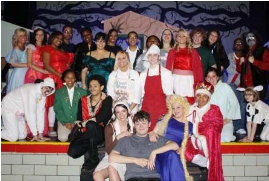
The cast & crew of the Spring Musical Into the Woods