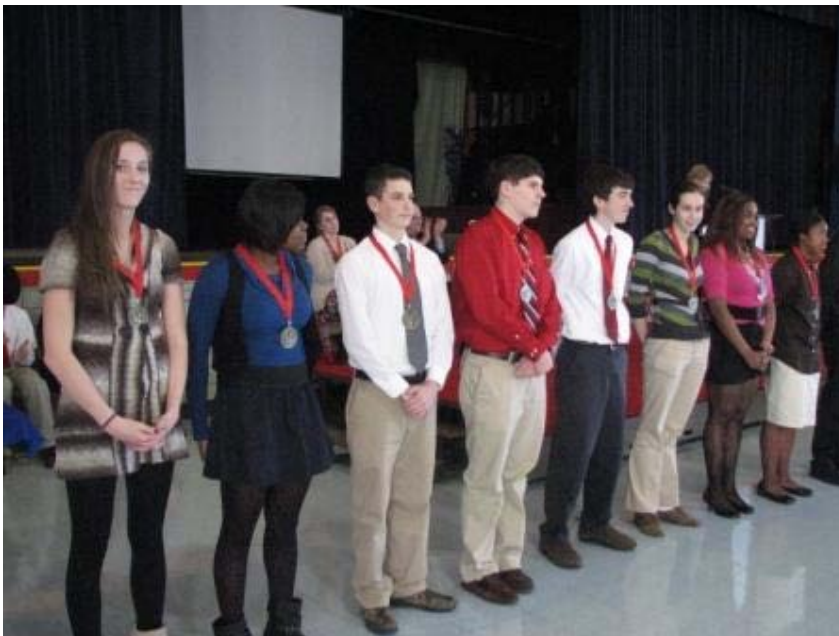
Some of the newly elected NHS Members

View all the pictures from the ceremony on VASJ's Facebook page by clicking here .