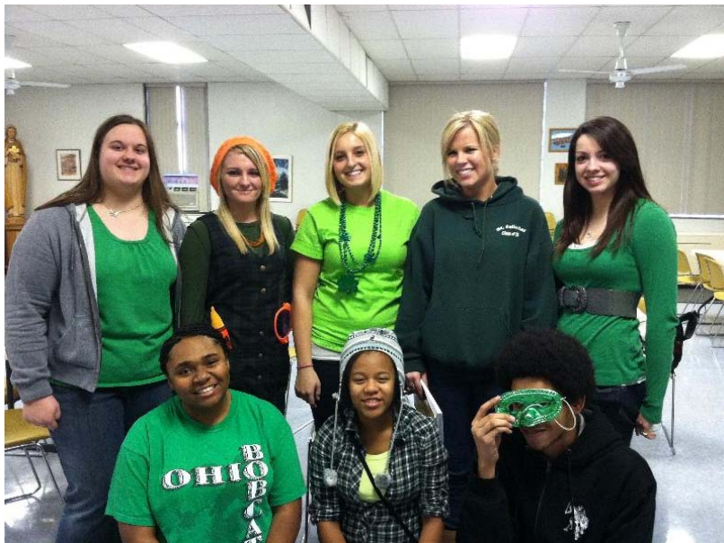
VASJ Students go "green" for St. Patrick's day!

If you are interested in having your picture as VASJ's Photo of the Month, submit your best Viking pictures to Emily Robinson .